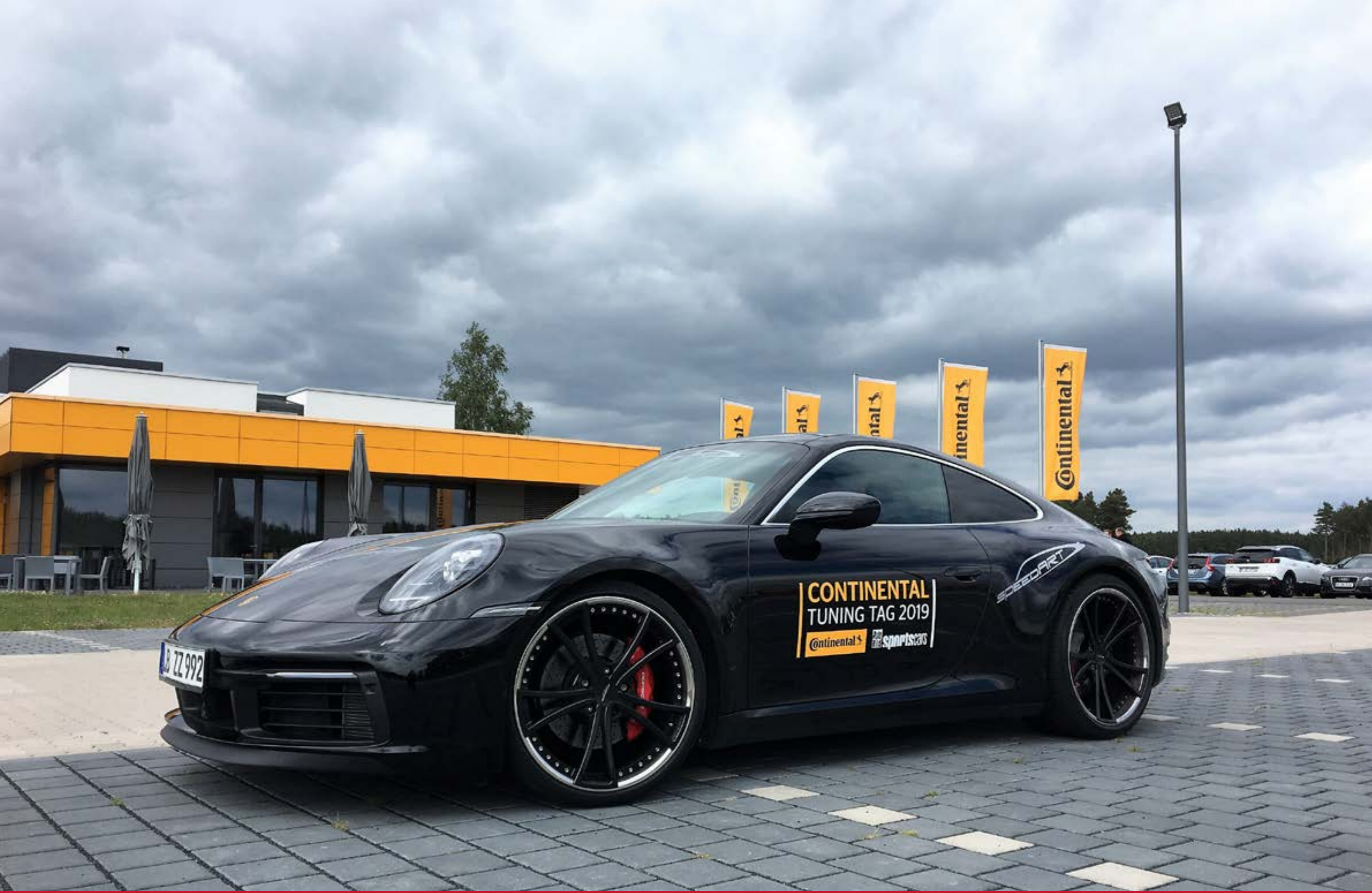
LSC: Light Spoke Competition - FORGED 21“