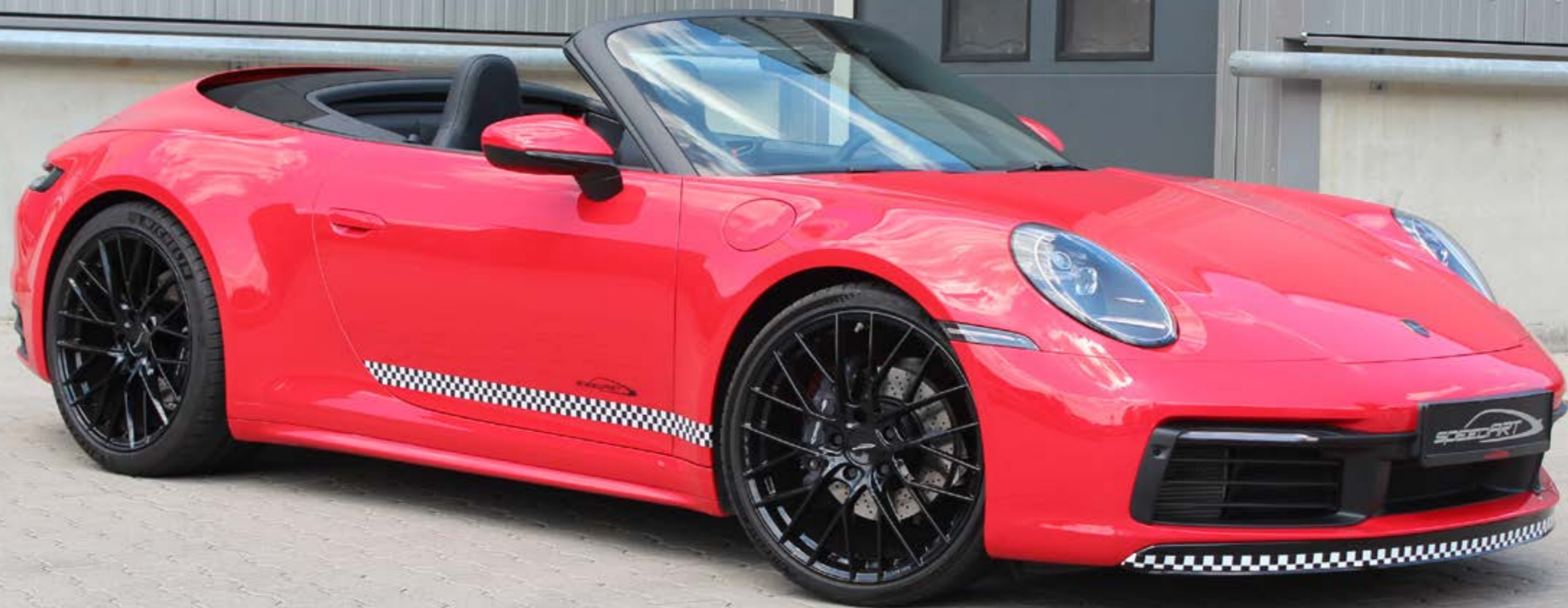
Cross-Spoke-Competition (CSC-Wheel) 21“