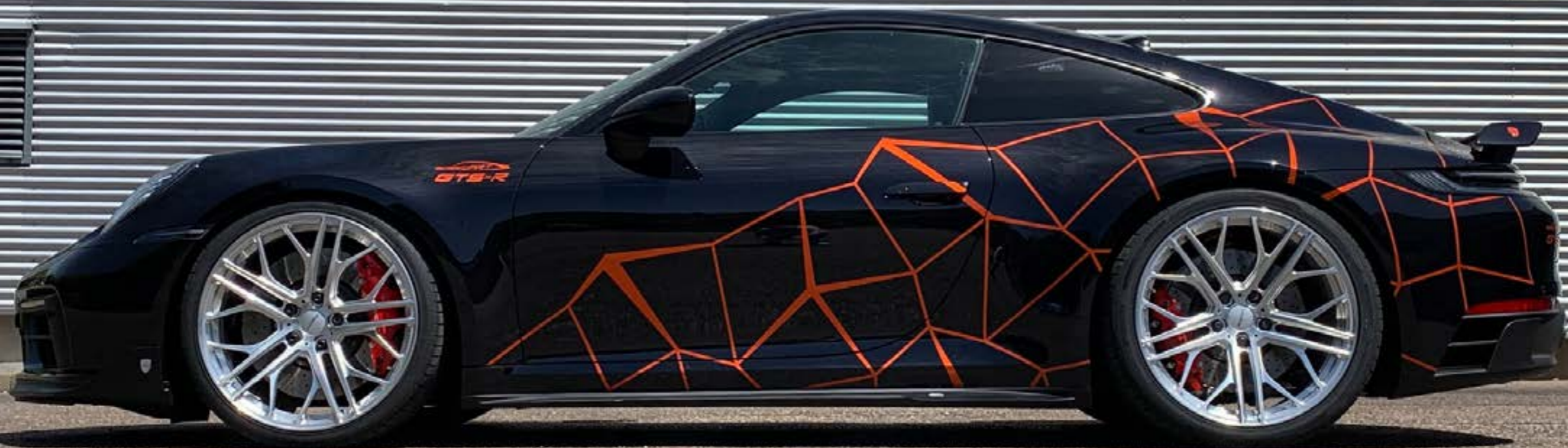
GTS-R - 20", 21" & 22"