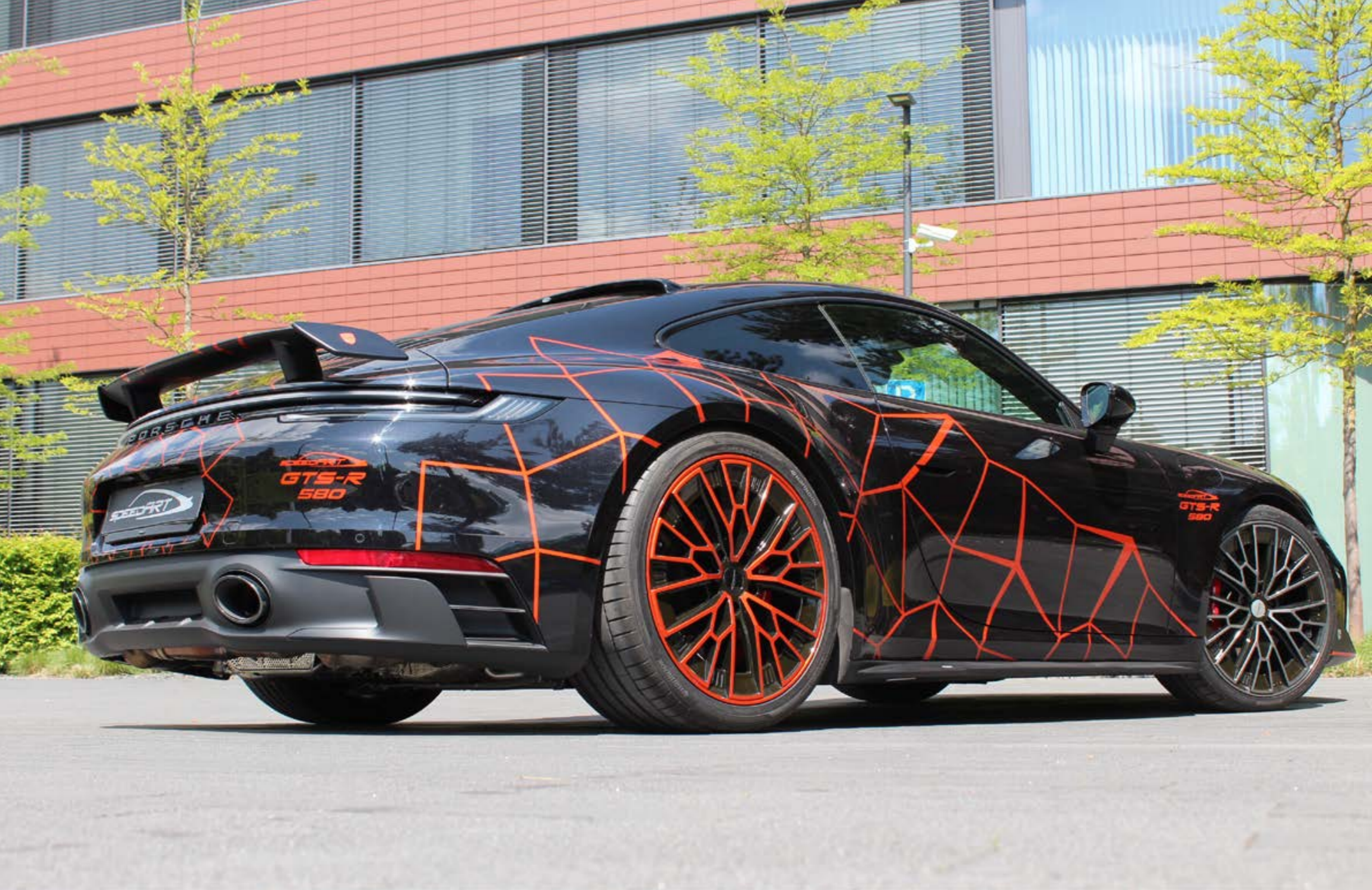
Cross-Spoke-Competition-II (CSC-II-Wheel) 21"